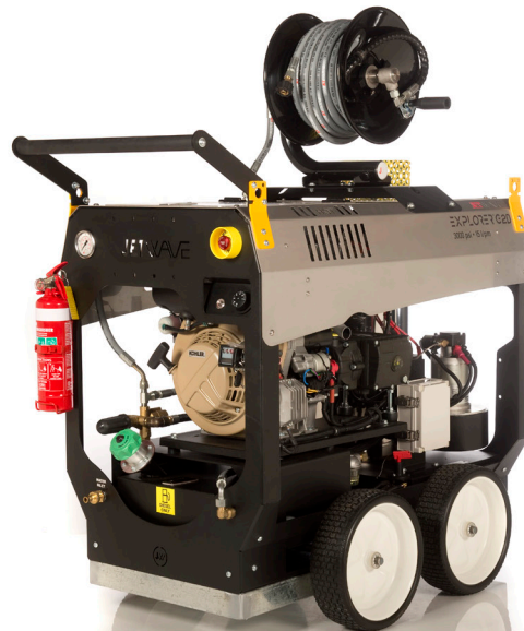
SHOWN WITH OPTIONAL TROLLEY KIT, MINESPEC KIT & HOSE REEL