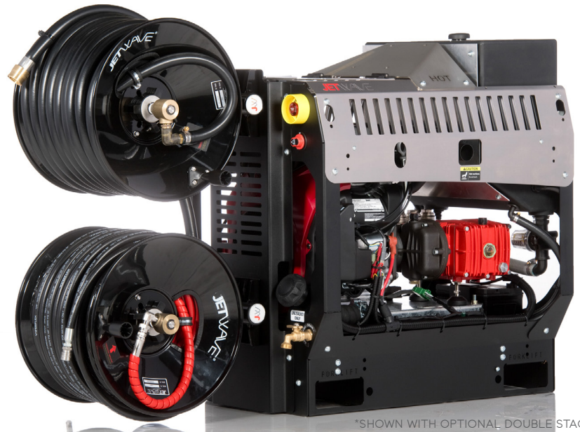
*SHOWN WITH OPTIONAL DOUBLE STACK KIT

The Jetwave® Scorpion™ G2FI heavy duty professional cold water petrol drain cleaner, powered by the new HONDA™ iGX800 fuel injected engine. Australian engineered and assembled using only the best quality Italian and global components; it offers world first Stainless Steel Exoskeleton (PEXO™) to maximise efficiency safety and minimise downtime.