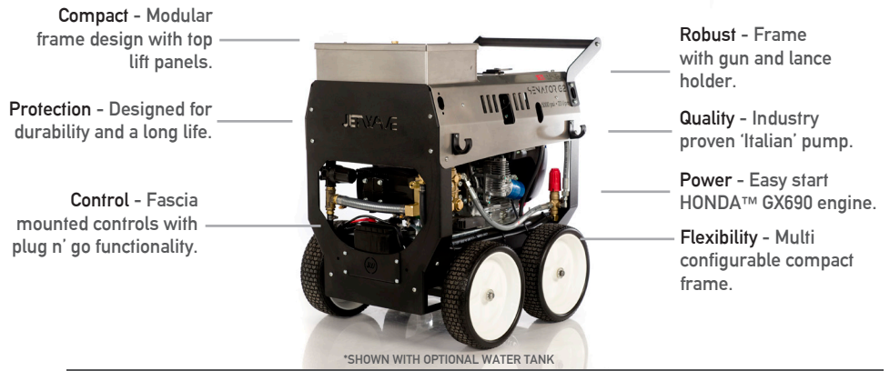
*SHOWN WITH OPTIONAL WATER TANK

Jetwave Group 72-74 Richmond Road Keswick | Adelaide South Australia | 5035 | AU +61 8 8371 3599 sales@jetwave.com.au jetwave.com.au