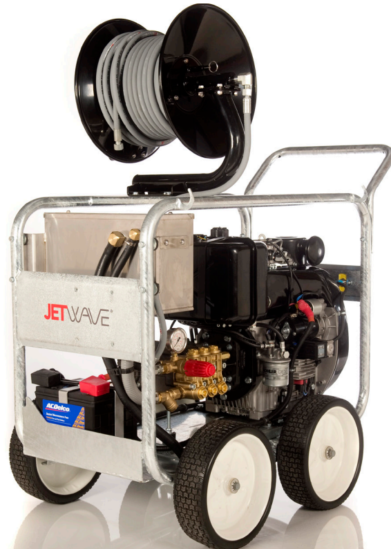
SHOWN WITH OPTIONAL WATER TANK, HOSE REEL & STARTER ISOLATOR.

The Jetwave® Senator D™ 350-23 heavy duty professional cold water diesel powered by KOHLER™ pressure washer. Australian engineered and assembled using only the best quality Italian and global components.