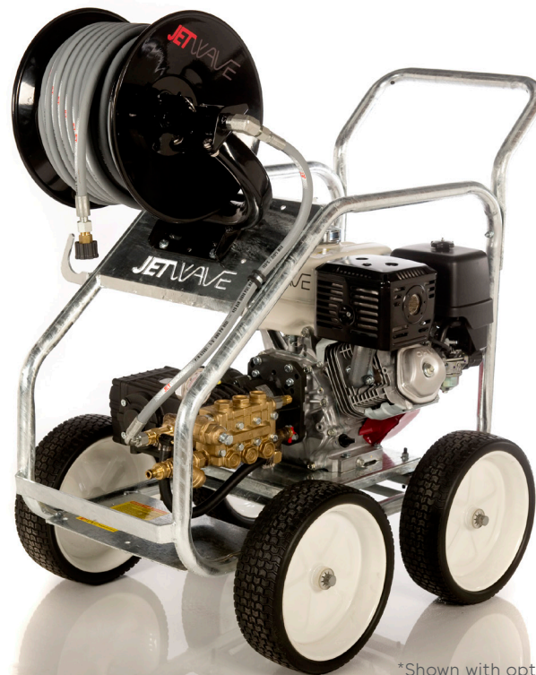
*Shown with optional hose reel

The Jetwave® Hornet™ 251 is a true heavy duty professional cold water petrol powered by HONDA™ pressure washer that has stood the test of time. Australian engineered and assembled using only the best quality Italian and global components.